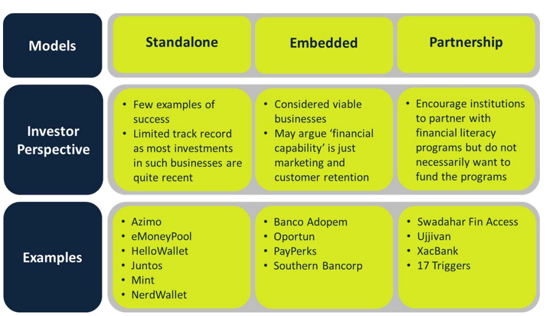
TABLE 2: Financial Capability Model Examples

Figure 2 below provides a framework for the universe of financial capability models that we encountered in our discussions with investors.